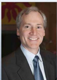
Marc Tessier-Lavigne, PhD President, The Rockefeller University 2013 University of Toronto Oliver Smithies Lecturer Winner, 2012 Henry G. Friesen International Award

"Brain Development and Plasticity: Molecular Control of Neuronal Guidance and Degeneration"